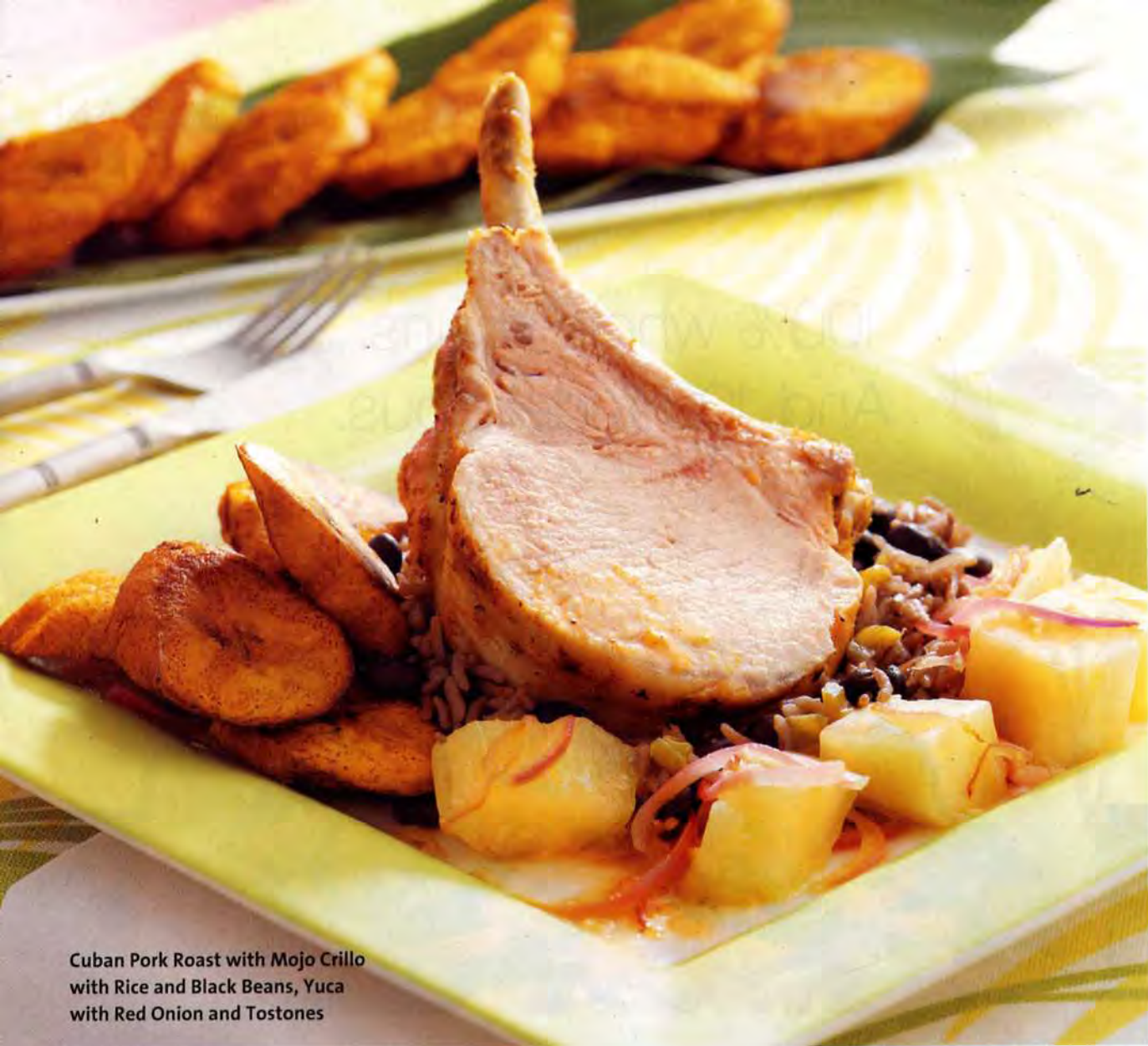
Cuban Pork Roast with Mojo Crillo with Rice and Black Beans, Yuca with Red Onion and Tostones

all the way through. Add to saucepan; cook until pink and firm, 2 to 3 minutes. Drain, discarding lemon and onion; let cool and cut into bite-size pieces.