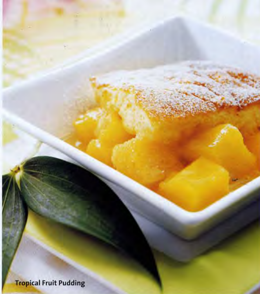
Tropical Fruit Pudding

This dessert is a tribute to the many desserts created by Cuban chefs. Serve with whipped cream spiked with rum.